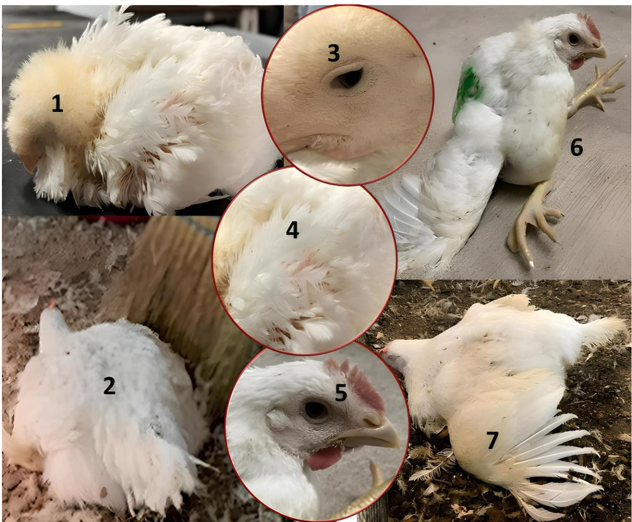
Figure 1. Diagnosis of BCO lame birds showing general symptoms of sick birds including head down (1), apathy towards external stimuli (2), pale eye sheet (3), ruffled feathers (4), pale crown (5), as well as specific lame signs including kinky back with posterior extended to the front (6), and wing deep down to support the locomotion (7).

Generally, broilers developing BCO lameness show clinical signs such as apathy to external stimuli, limping gait, pale eye sheet, pale crown, ruffled feathers, kinky back, and paresis (Mutalib et al., 1983; Nairn and Watson, 1972; Wideman, 2016). If BCO lesions occur in the head of the long bones, the birds dip down one wing or both wings to bolster their locomotion (Thorp et al., 1993). In summary, microbiology studies of bacterial BCO enable further understanding of the disease symptoms and pathogenicity which are important for the development of detection and intervention measures combatting BCO lameness in broilers.